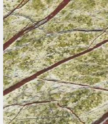
RAIN FOREST GREEN