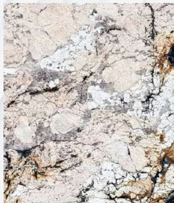
ALASKA ROSE GOLD