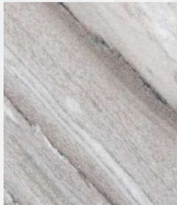
BRUNO WHITE WAVE