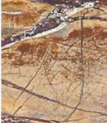
RAIN FOREST BROWN