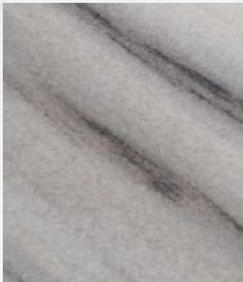
BRUNO WHITE CROSS